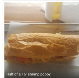
Half of a 16" shrimp poboy